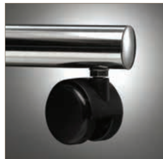
Castors Fitted as standard