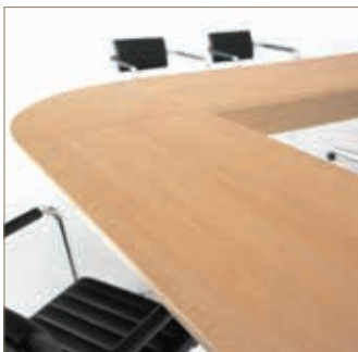
U-shape Using a quadrant corner a u-shape can be created

Flip-Top allows boardroom and trapezoidal set-ups while the quadrant corners enable U-shape and closed square layouts. FLT.12 & FLT.13 can be used to create an oval boardroom table with the additional versatility of using the end tables as stand-alone consoles.