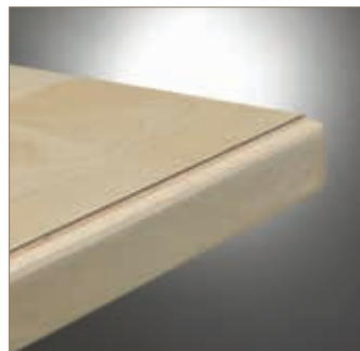
Hardwood Leading Edge 25mm hardwood leading edge as standard. Other edges are available on request