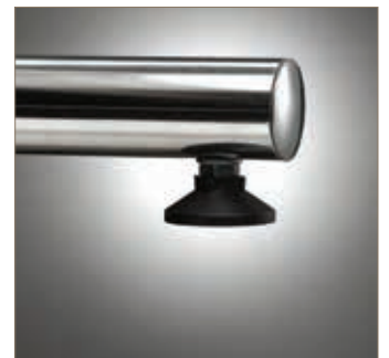
Adjustable Glide Fitted as optional extra. Please specify with order